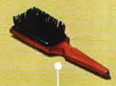
Wooden coat brush with nylon bristles, Hyatt Regency Delhi ( www.delhi.regency.hyatt.com )