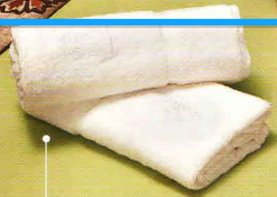
Terry cloth bath towels, The Ritz-Carlton, Bangalore ( www.ritzcarlton.com )